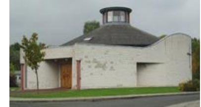
St. Colman's Church

Sunday Masses Vigil 6.30pm. 10.00am & 12noon